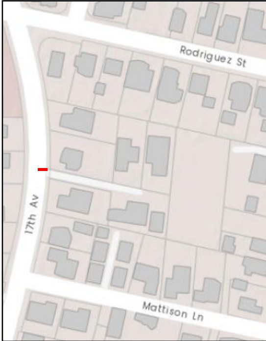
17 th Avenue